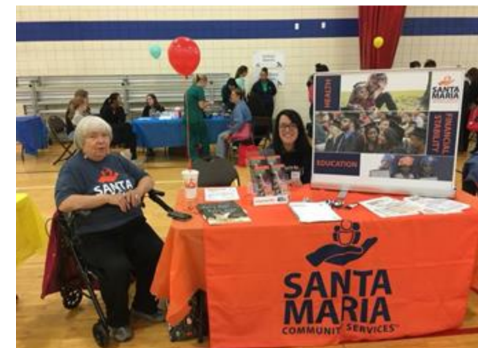
Booth at Biannual Santa Maria Health Fair

Language barriers associated with Hispanic, non-English-speaking patients are well documented, with Hispanic patients reporting lower levels of overall satisfaction with their medical care, specifically relating to the explanations they were given regarding prescribed medications and possible deleterious side effects. Furthermore, many non-English-speaking patients have reported they feel as though their doctor does not understand how they are feeling.