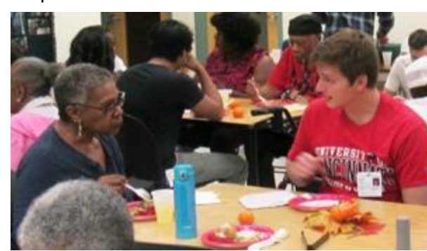
Fig. 1: Connecting with MNM's elderly population at a "Creative Aging" event. Recipes and stories for the cookbook were collected at these events and then collated to form the final product.

The target population for our project are the Walnut Hills seniors served by MNM through their Creative Aging program: low income adults 60 years and older who live in zip codes 45206 and 45207 [3]. Overall, MNM have around 125 senior clients, including 63 homebound seniors with certified home care aides. MNM hosts monthly social events to prevent social isolation and provides transportation for their many patrons who have limited access to transportation.