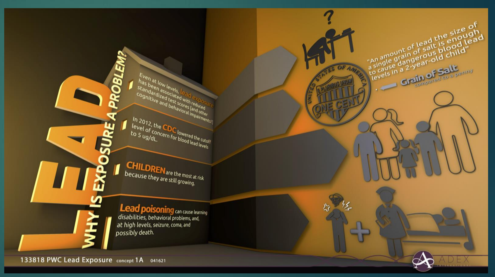
Concept Render, ADEX International